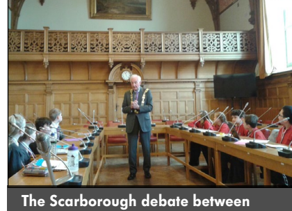
Newby and Scalby Primary School and Northstead Primary School

It is clear that children have polished up their debating